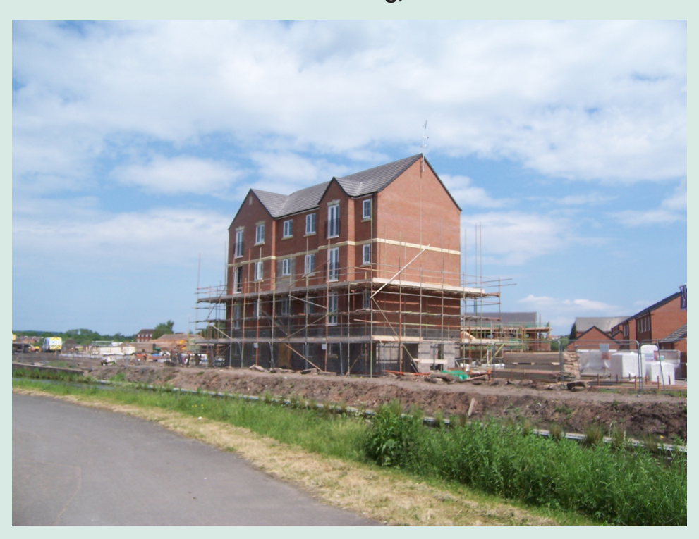
New Affordable Housing, Kidderminster

Out of the 376 affordable homes completed since the start of the plan period, 94 (25%) 3.9 have been provided by private developers via a section 106 agreement. Despite the lowering of the thresholds for the provision of affordable housing, viability assessments are likely to be used more often to show that provision of 30% affordable housing will render a development unviable. With potential housing allocations in the Site Allocations and Policies DPD and Kidderminster Central Area Action Plan DPD being on brownfield sites, the likelihood of lower percentages being offered by developers is high. Lowering the threshold to 10 in Kidderminster and Stourport-on-Severn and to 6 elsewhere in the district, will help to deliver some affordable housing on sites that would have come in just underneath the previous threshold but 30% provision is unlikely in the current economic climate. Also, the number of 100% affordable schemes being developed is likely to fall with grant funding harder to attract. At October 1st 2012, there were 122 affordable dwellings under construction with 106 not yet started. Since 2006, the % of affordable housing completions has varied from only 3% of total completions in 2006/07 up to 39% in 2008/09. It has been above 30% for 4 out of the 6 years, mainly helped by 100% affordable schemes.