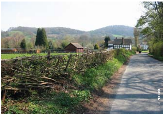
Newly laid hedge at Petty France