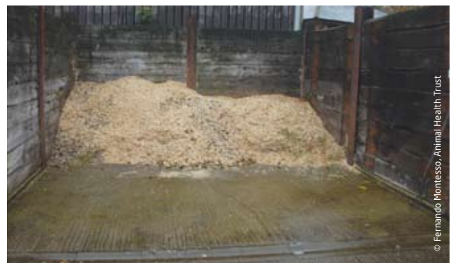
Permanent manure store

A well-constructed permanent manure store must therefore have a concrete base, which slopes to the back of the store (in the absence of a sealed underground tank). It should also have solid sides that prevent the muck spilling out and contaminating adjacent land. Ideally, the muck should be kept as dry as possible.