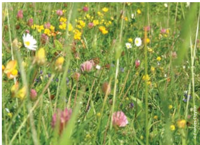
Species-rich chalk grassland grazed solely by horses