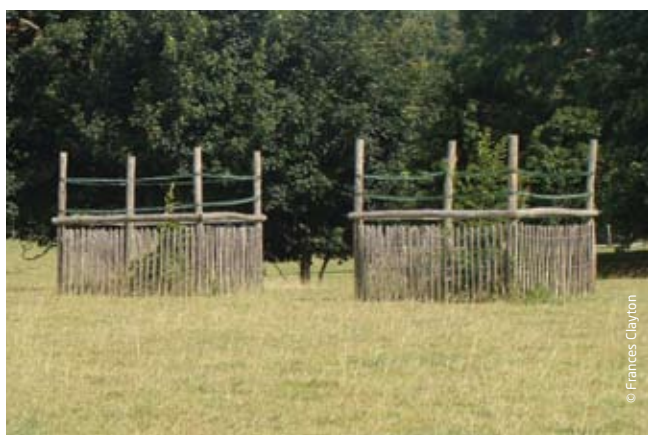
Tree guards prevent damage by horses