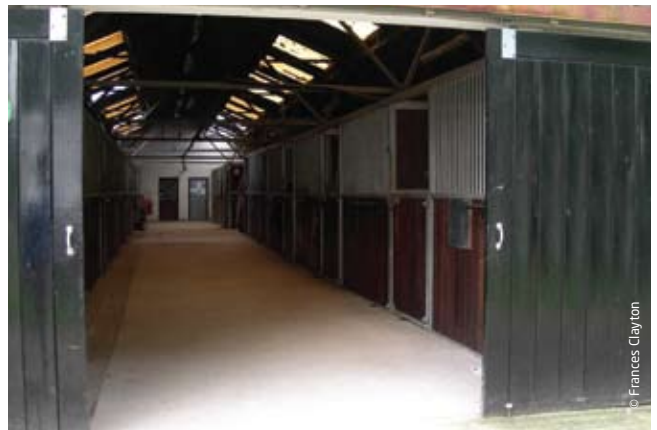
Stables built into an existing building