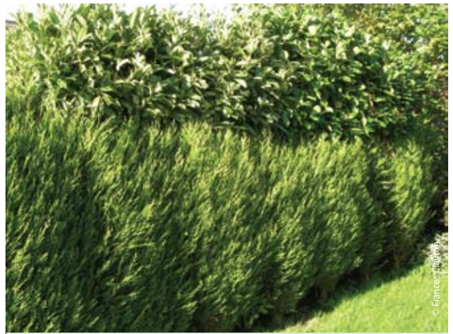
Inappropriate hedge species