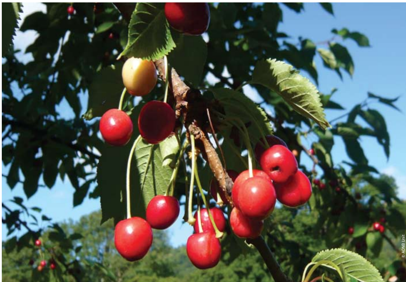
Leave berries on trees and hedges as long as possible to provide winter food for birds

A brief summary of the law is provided in the leaflet, 'The Hedgerows Regulations: Your questions answered'. More detailed guidance is available in 'The Hedgerows Regulations 1997: A guide to the law and good practice'. Both are available free of charge by emailing farmland.conservation@defra.gsi.gov.uk