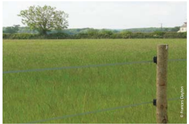
Dark electric tape and wooden posts providing visually sensitive fencing