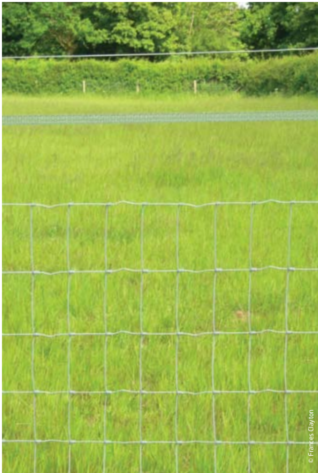
Landscape sensitive and horse-friendly wire fencing