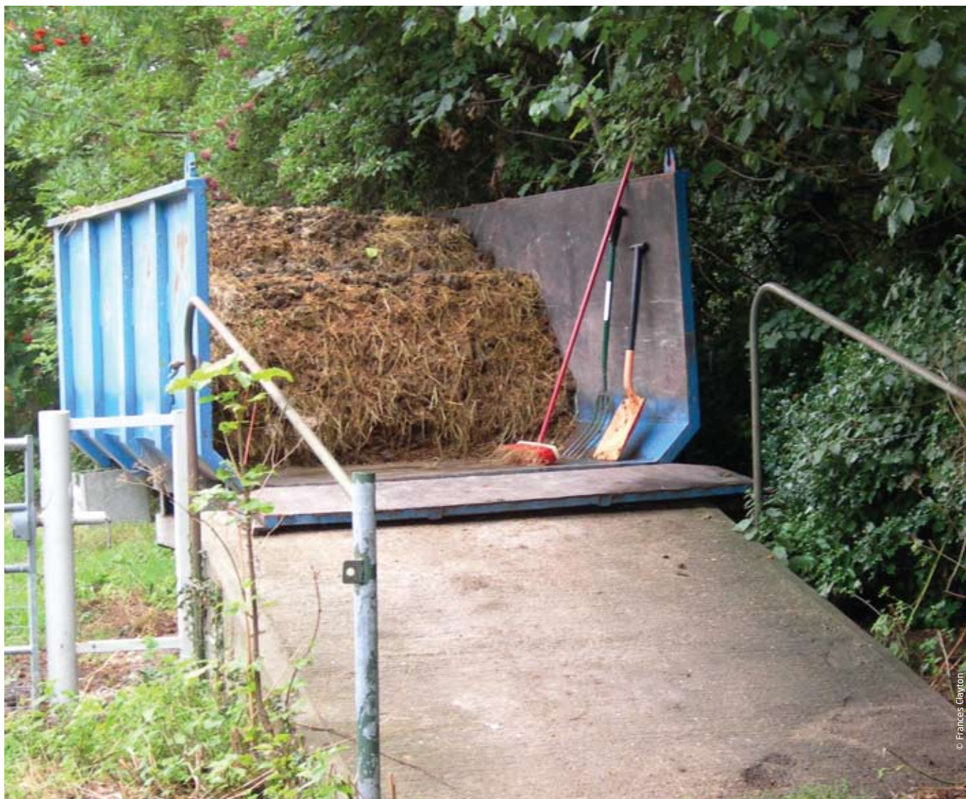
Manure storage at a livery yard ready for removal

You can use the recycling directory on www.wasterecycling.org.uk to search for facilities in your local area.