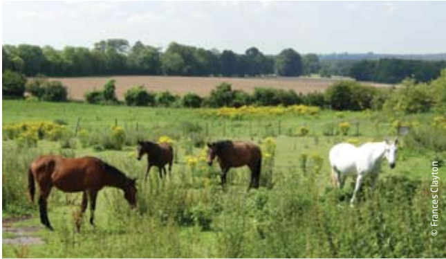
Weed encroachment into pasture