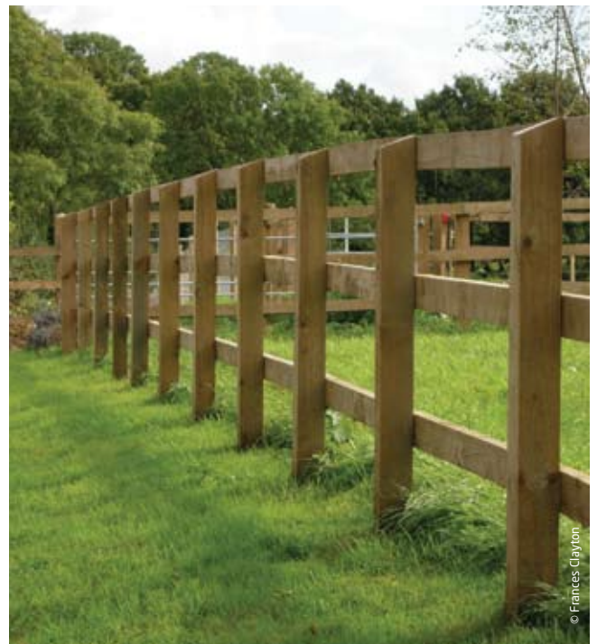
Visually insensitive ranch-style fencing