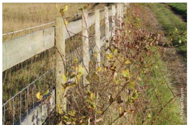
Hedging can screen fencing