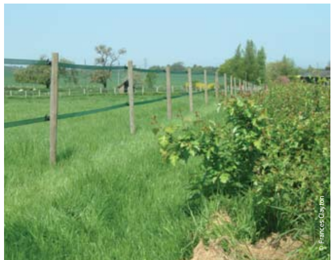
Hedge planting protected from horses with suitable fencing