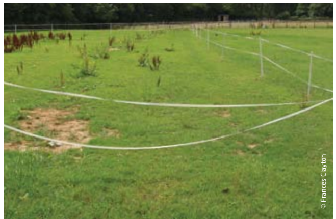
Visually insensitive electric tape