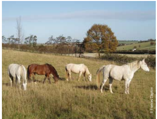
Horses grazing on standing hay

supplementary feed. However, this can result in behavioural problems. Gastric ulcers and lacerations can also result if horses go for more than four hours without some forage 2 .