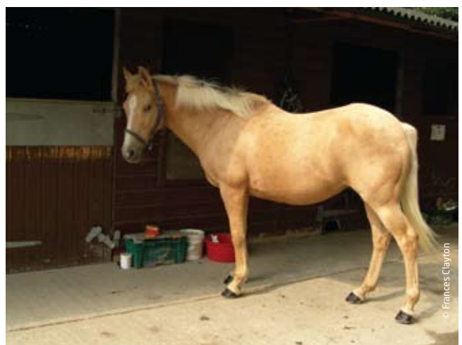
Horse outside stables