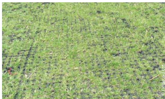
Grass matting can help to reduce poaching around gateways