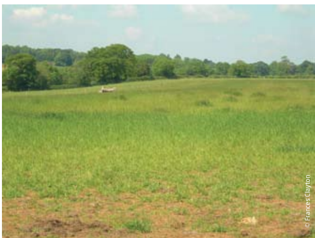
Field size should respect landscape character