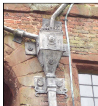
Lead downpipe and hopper at Harvington Hall