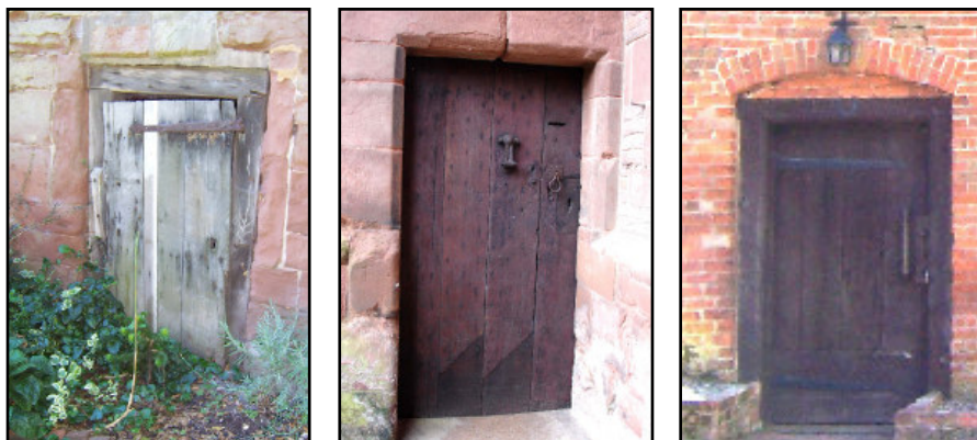
A selection of doors within the Area

The traditional doors found within the Area compliment the historic character of the hamlet.