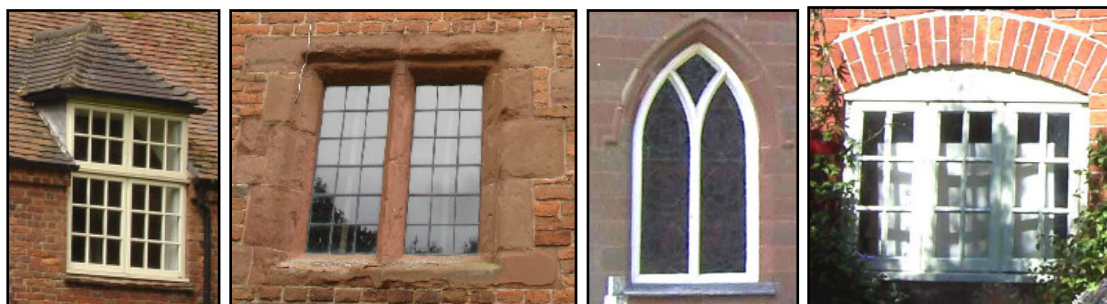
A selection of windows from within the Area

The variation in the type, construction and finishing details of the windows assist in creating the Area's character.