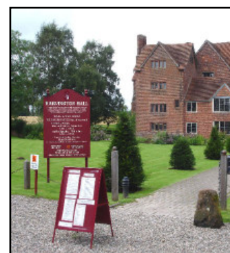
Example of signs present outside Harvington Hall

Hard landscaping and street furniture have been kept to a minimum within the Area. Highway signs are present on approach to the hamlet and are related to speed restrictions. Other signs in the Area that relate to either the Hall or the Church are painted a dark red which provides some continuity within the Area. The signs are well maintained, limited in number and removable, all of which helps to negate the potential negative impact that they could have on the Area.