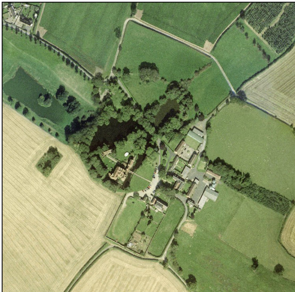
Cities Revealed(R) Copyright by the GeoInformation(R)Group, 2003 and Crown Copyright (C) All rights reserved

Harvington Hall stands on a triangular-shaped island with an attendant malt house and chapel. It is surrounded by a roughly square moat traversed by two stone bridges. The site is a scheduled ancient monument and the Hall is Grade I listed. Harvington Hall is open to the public and is renowned as having one of the finest surviving series of priest's hiding places in England.