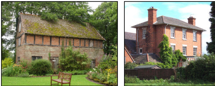
Left, the Malthouse, right the Priest's House

The style of Harvington Hall itself ranges from medieval to Elizabethan with 18 th and 19 th century additions.