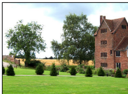
Colour within the Area is provided by both the built and natural environment

The grasses and trees within the Area, and the views out across the agricultural landscape also provides colour to the Area which changes dependent on the season.