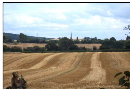
View out of the Area towards Chaddesley Corbett

The views out of the Area reinforce the sense of the rural location of the hamlet. Views across agricultural land can be gained from many parts of the Area including from the south bridge of the Hall. The south east part of the Area affords views across to Chaddesley Corbett, identifiable by St Cassian's church spire.