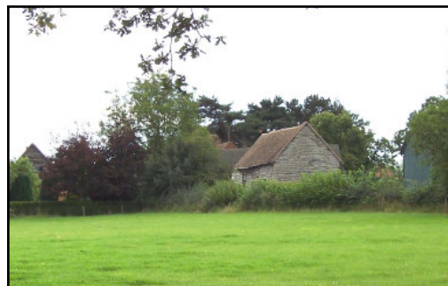
View into the Area from the Monarch's Way footpath

Glimpses into the Area can be gained from the footpath that skirts the outside of the moat and the Monarch's Way footpath which provides a glimpse to the range of farm buildings that lie on the eastern side of the Area.