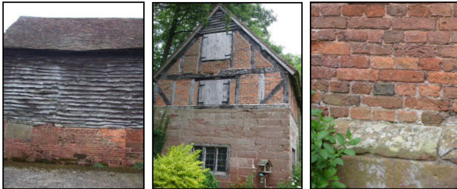
Examples of construction methods within the Area

There are also examples of timber framing within the Area, some such as the Malthouse have been left exposed, while other timber framed buildings such as Harvington Hall Farm have been clad in brick. The barn about 20 metres north of Harvington Hall Farmhouse has had its oak timber framed exterior surfaced in elm boarding. However, within the Area the facing material is typically left untreated which emphasises the natural colours of the sandstone and brick.