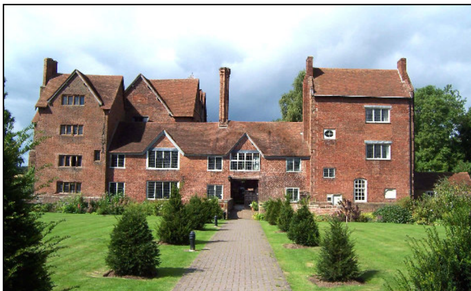
Harvington Hall is the principle landmark of the Area