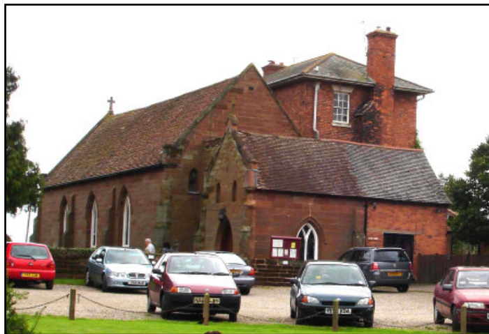
Examples of tranquil and active areas