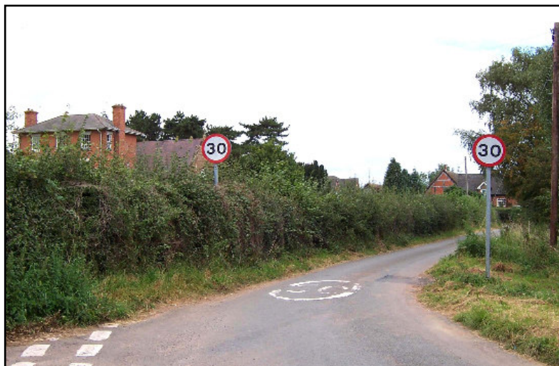
The traffic signs are an alien feature within the Area

The Area, on the whole, has maintained its “traditional character”. Perhaps the most noticeable alien feature within the Area are the highway signs present when approaching from the south east. The road is flanked by two 30mph signs in addition to a road marking. At this location where the road is narrow and the signs can be clearly seen, it may be more appropriate to only have one sign.