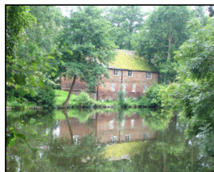
Focal points in the Area include the moat, the Wain House and the 18th century chapel