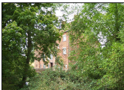
Views within the Area are often limited

The buildings that lie to the east of the Area are partially screened from view by hedgerows and trees.