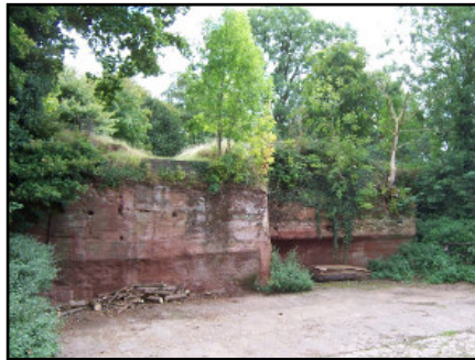
One of the quarries within the Area.

One of the key characteristics of the Area is the high quality and historic interest of the structures within it. There are twelve Statutory List Entries within the Area. Harvington Hall is Grade I listed which denotes the Hall as being of ‘exceptional interest.’ It is one of only six Grade I listed buildings in the District. The Hall and moat have also been scheduled as an Ancient Monument. Scheduling is only applied to archaeological sites of national interest.