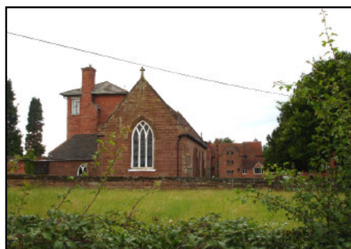
Left, the 18th century Chapel, right, 19th century St Mary's Church