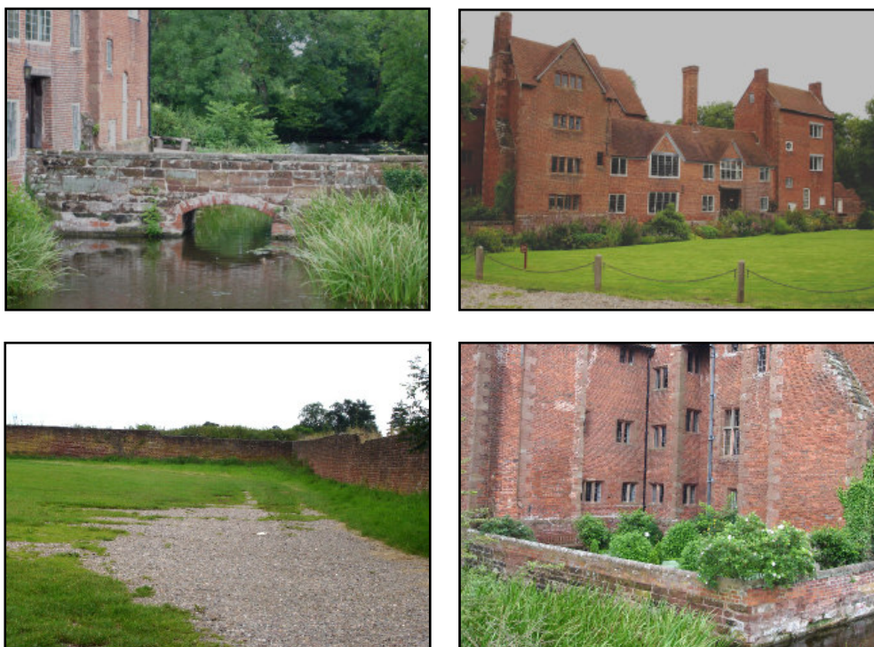
Top left to right, the moat, the lawned section in front of Harvington Hall, Bottom left to right, the Walled Garden, the herb garden

The herb garden in the south-east angle of the moat has recently been restored and replanted.