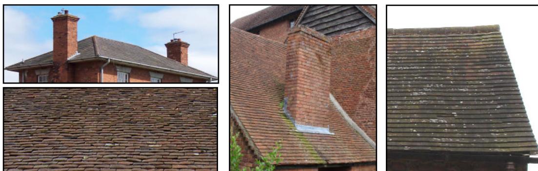
An example of the roofing materials found within the Area

The roofing materials provide a textual richness to the Area, with the irregularity and undulating unevenness of the hand made clay tiles adding to the historic character of the Area.