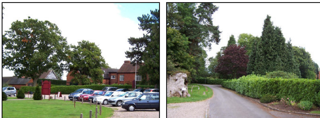
Examples of how trees in the Area provide both interest and colour and also serve as a screen, hiding buildings from view

There is one Tree Preservation Order in the Area which covers three pine trees outside the Church. Trees within the Area and not covered by a Tree Preservation Order are still afforded some protection through the Conservation Area designation.