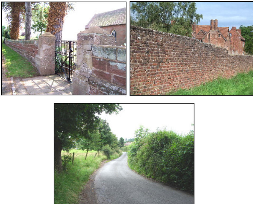
Top left, the churchyard wall, top right the Garden Wall, bottom, hedgerows on approach to the Area